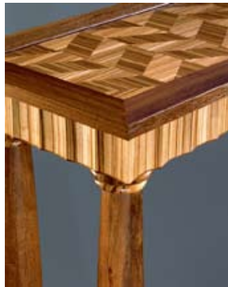
Table with inlay