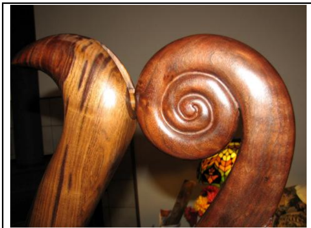
Lizard Tail Detail

where English Walnut "marbled" with the Claro. The pegs and sockets for the pivots are of Lignum Vitae. The cradle can be lifted from the stand by raising it from one side of the stand and pulling the peg from the other side.