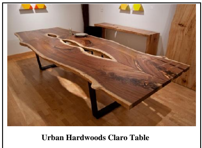
Urban Hardwoods Claro Table

Initially, the company milled the wood, dried it and sold the material to furniture makers. Over time, the company evolved such that it now manufactures finished tables and table-tops and no longer sells the material. Urban Hardwoods' tables are high-end, priced from $3500 - $50,000, and the company's sales are in the $4 - 5 million range. Nick thinks that the Bay area is an ideal market for these products, especially in Silicon Valley.