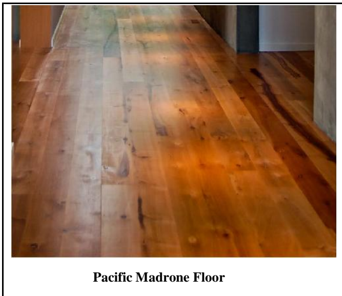
Pacific Madrone Floor

Madrone is one of the most abundant hardwoods of the West Coast, yet few furniture buyers know about it. Many woodworkers shy away from it due to its inherent instability. However, recent advances in drying and sawing techniques are now producing high-quality timber suitable for furniture and many other uses. Although the wood can be quite plain, it is also available in many figured patterns, just as beautiful, but generally less expensive than other figured woods.