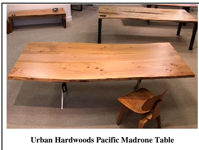
Urban Hardwoods Pacific Madrone Table

Urban Hardwoods does online advertising through Google Ads utilizing Search Engine Optimization (SEO). There is not enough space in this article to address this topic in detail, but there are many references on these subjects such as: http://searchengineland.com/guide/what-is-seo and http://www.google.com/intl/en/ads/ . Google Ads is an amazing service. One pays only when a user clicks on the ad and the amount of money spent can be limited to any amount. For example, if you pay Google $1/click, you can limit your exposure to, say, $20 or 20 clicks. Free of charge, Google will assign you an advisor who will help you write your online ad, test its efficacy, and help you adjust your message for maximum impact.