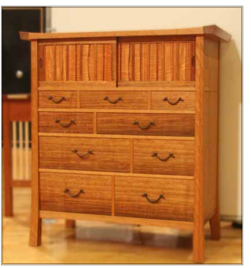
Best Furniture: Torii 2 by Larry Stroud

Larry Stroud's piece, Torii 2, was awarded Best Furniture piece. It is a substantial chest with a curved top, sliding doors on the top with panels of tineo, a strongly striped South American wood. The piece is meant to evoke a Japanese gate. Some of the praise included the phrases 'lovely piece' 'very well composed' 'pleasing proportions.' There was some discussion of a handle that seemed a bit lost looking. Om Anand found the panels somewhat compressed, on which point, John Levine found room in the drawer widths that might have been stolen in favor of the sliding doors. These were minor points in what was seen overall as a very impressive piece. Great job in matching the veneers on top.