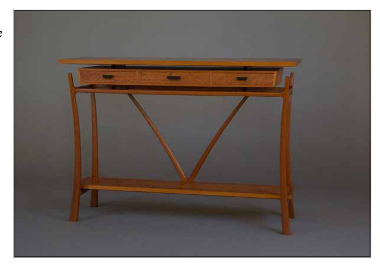
Best of Furniture: Hall Table by Michael Selser

overbearing. The dovetailed drawers are nicely executed.