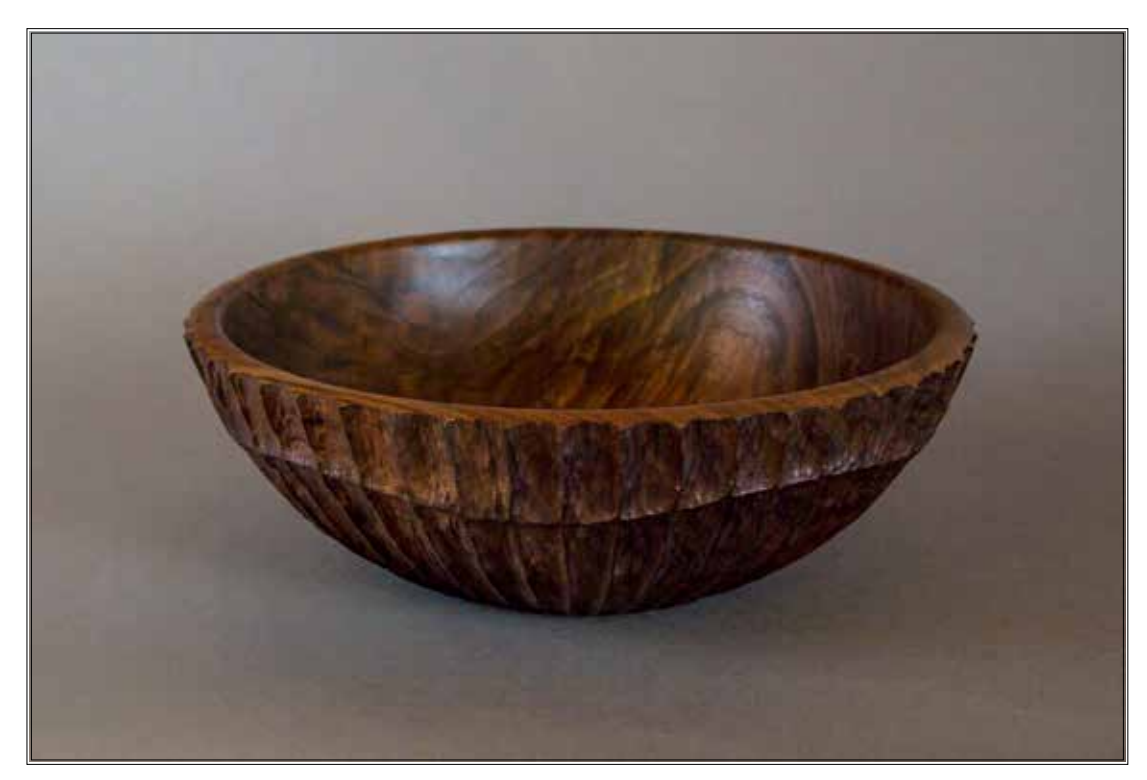
Best of Woodturning: Turned/Carved Claro Walnut Bowl by Hugh Buttrum

"Straw Marquetry Box," also by Joe Amaral, was veneered on its exterior with flattened slivers of straw in a flawlessly executed marquetry sunburst pattern. Straw marquetry is the art of forming a decorative panel using flattened slivers of natural cured straw. The stem is split, flattened, softened and scraped or ironed into a flat ribbon. It is then inlaid edge to edge on wood until the surface is covered. The interior of the box is lined with leather. It was declared the Best of Miscellaneous category winner.