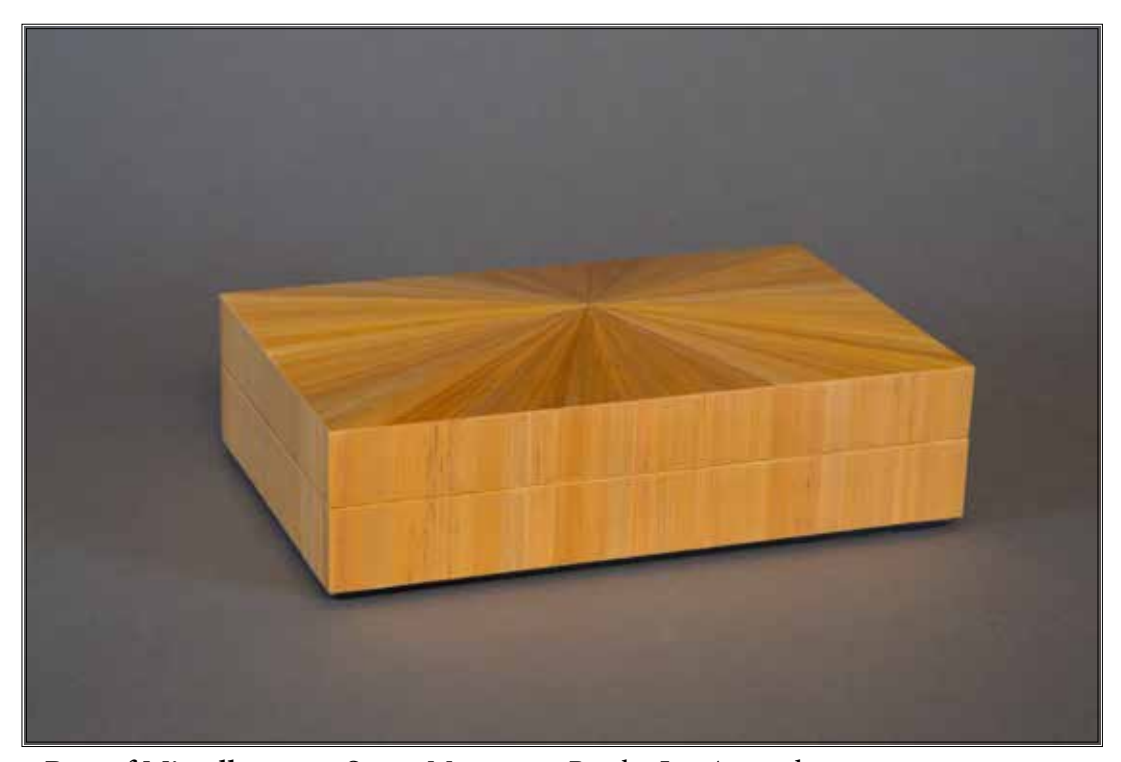
Best of Miscellaneous: Straw Marquetry Box by Joe Amaral

Joe Amaral's "Decorative Box" is a beautiful example of Japanese urushi lacquer. The finish comprises between 40 and 50 coats, and when viewed with a good light source the depth of the top is three-dimensional. Truly spectacular. The sides are eggshell craquelure, and the interior is lined with velvet. The judges presented it an Award of Excellence .