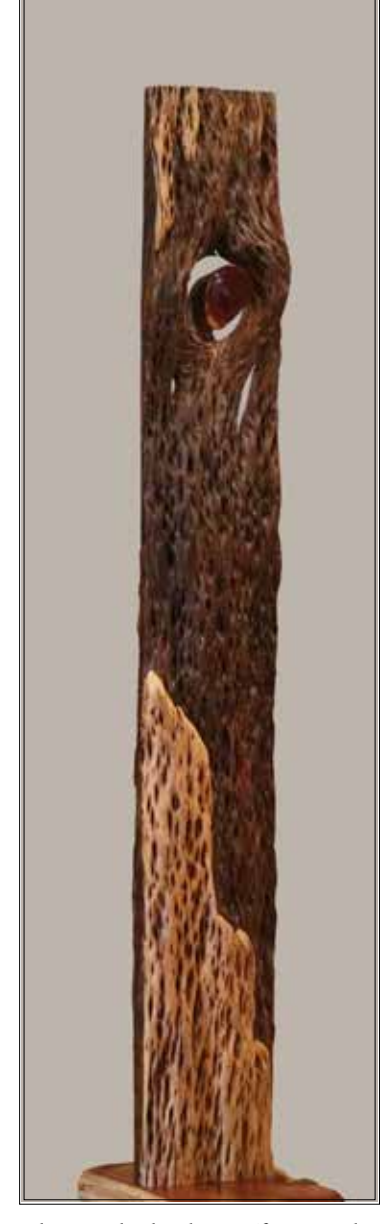
Shiva/Shakti by Jeffrey Dale

"Shiva/Shakti" by Jeffrey Dale is a magnificent tribute to an unusual tree. Pulled from a single piece of black acacia by subtractive processes only, the many hours of hand work are evident. The surface of the timber was picked clean of bark inclusions, leaving behind a pockmarked surface of heartwood and sapwood that causes the viewer to wonder how Nature could produce such a thing. Jeffrey refers to the indentations as bird's eyes, and they extend completely through the thickness of the piece. Near the top of the piece there seems to be an eye in a socket; closer examination shows that it is actually a part of the original timber, a large knot, not something that was added. Well done, Jeffrey. The judges agreed, and gave it an Award of Excellence.