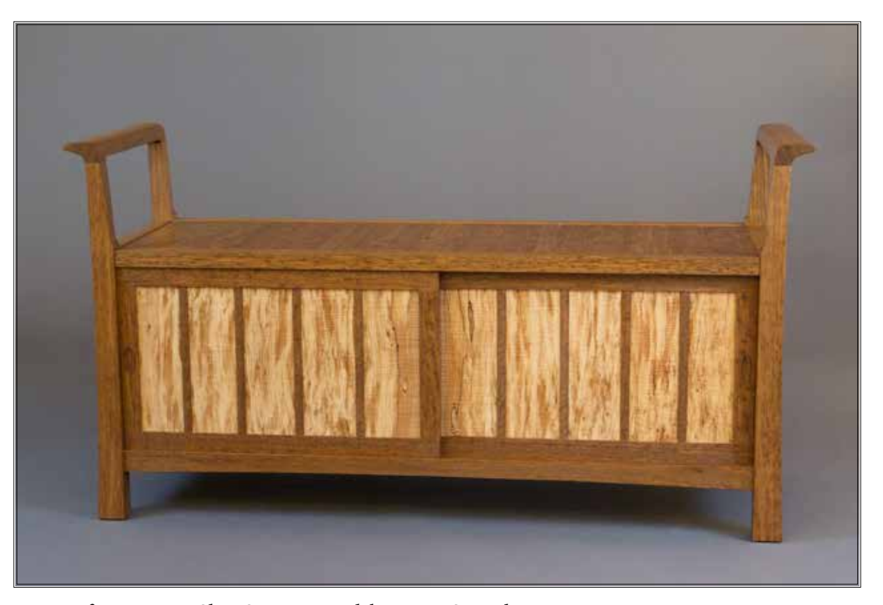
Best of Furniture: Shoe Storage Bench by Larry Stroud