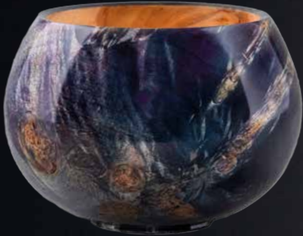
Perseids