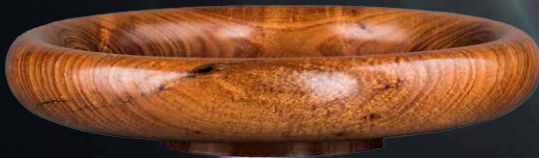
Curvilinear Bowl by Chuck Quibell