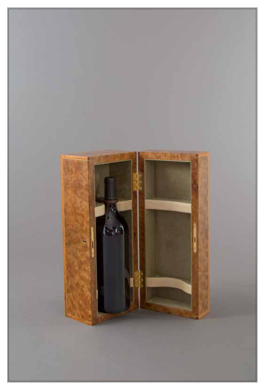
Best Box: Veneered Wine Box by Kent Parker