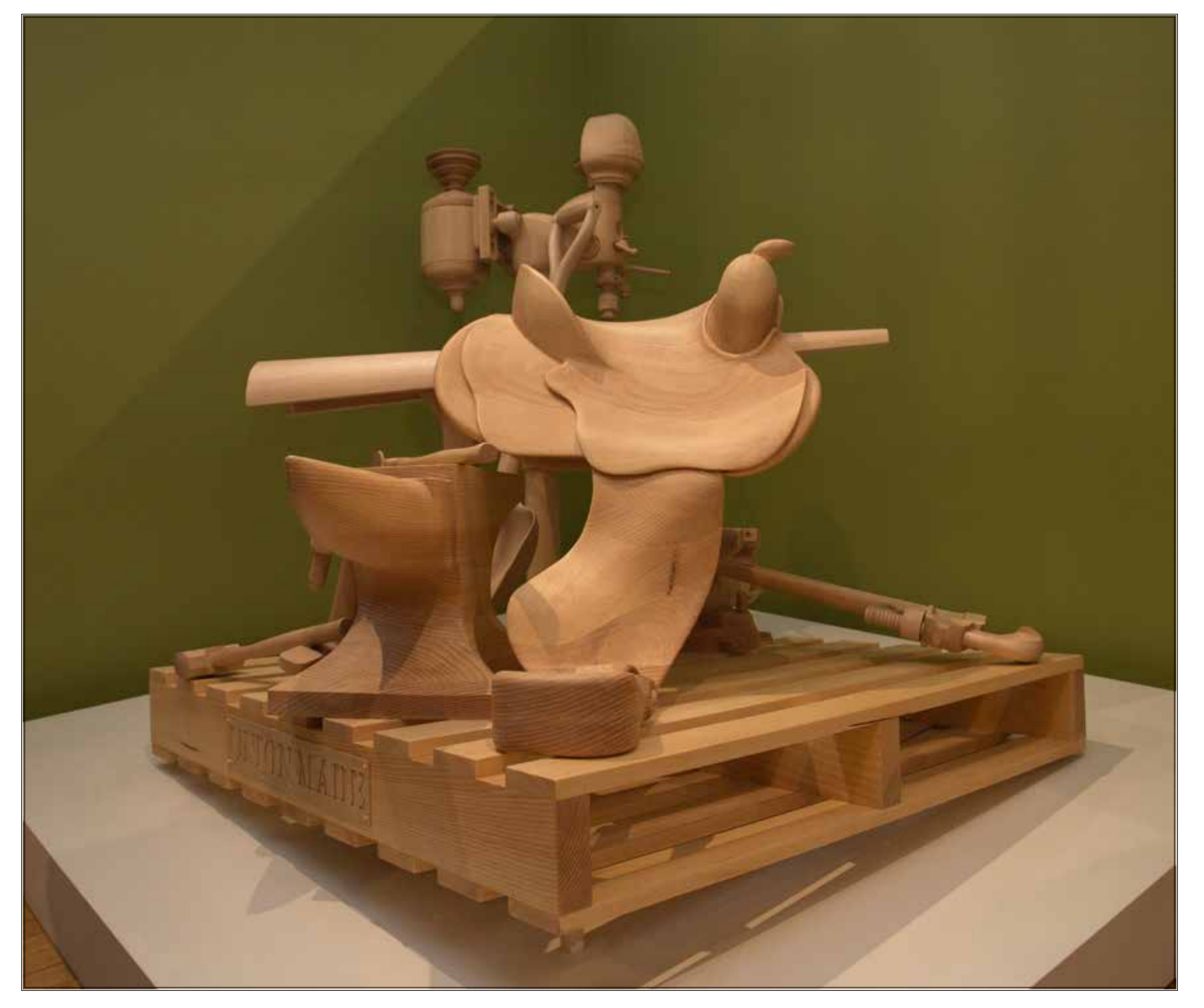
Best of Show: The Calculated and Systematic Dismantling and Sinking of Blue Collar Workers by Michael Cooper

The Best of Show winner was the magnificent sculpture "The Calculated and Systematic Dismantling and Sinking of Blue Collar Workers" by Michael Cooper.