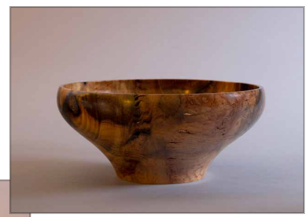
Big Zipper by Les Cizek