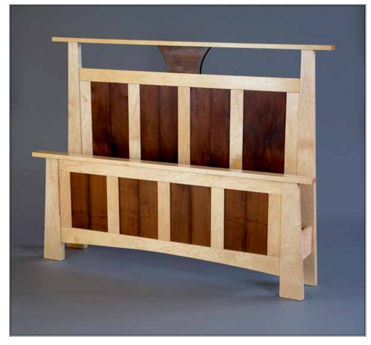
Old Growth Redwood and Eastern Maple Bed by Jennifer Larocque