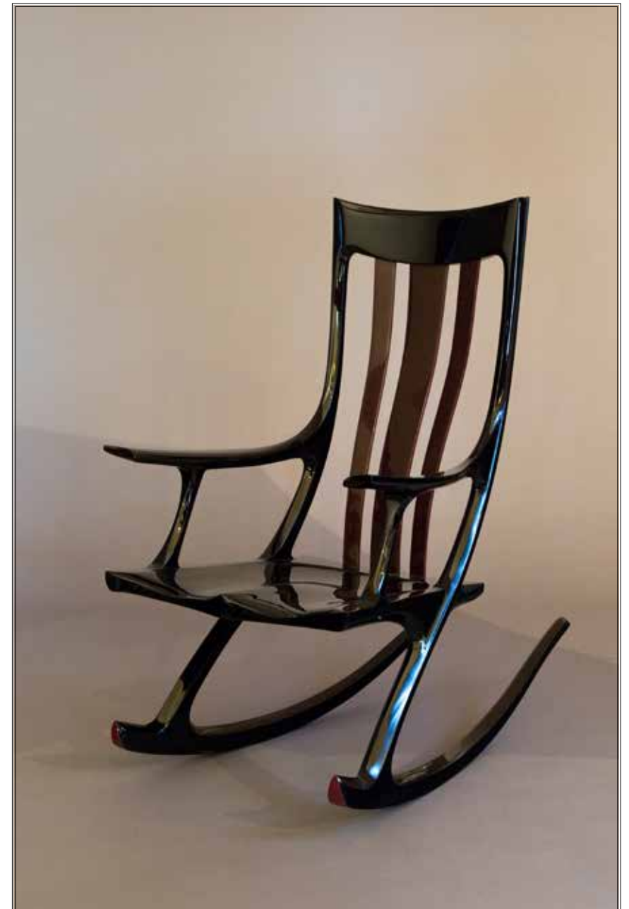
Lady Gaga Rocker by Dugan Essick, AiW 2017