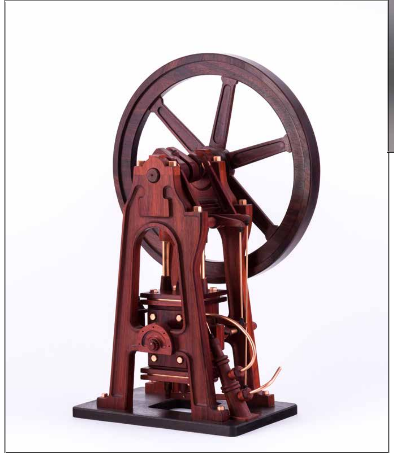
Early internal Combustion Engine by Donovan Miller, AiW 2014