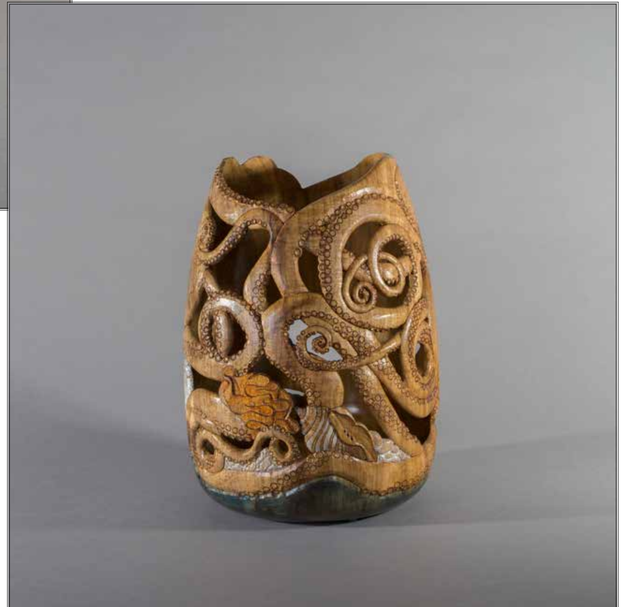
Octopus by Charlie Saul, AiW 2019