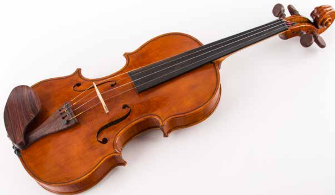
Violin - Copy of 1721 "Kruse" Stradivarius by Mark Tindley, AiW 2015