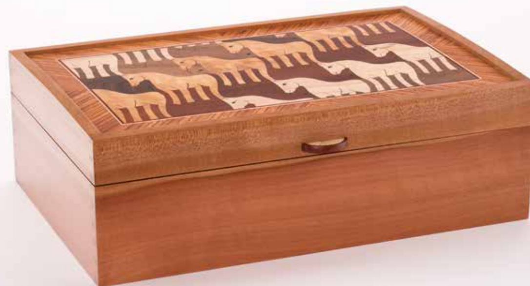
Escher's Inspiration by Joe Scannell, AiW 2015