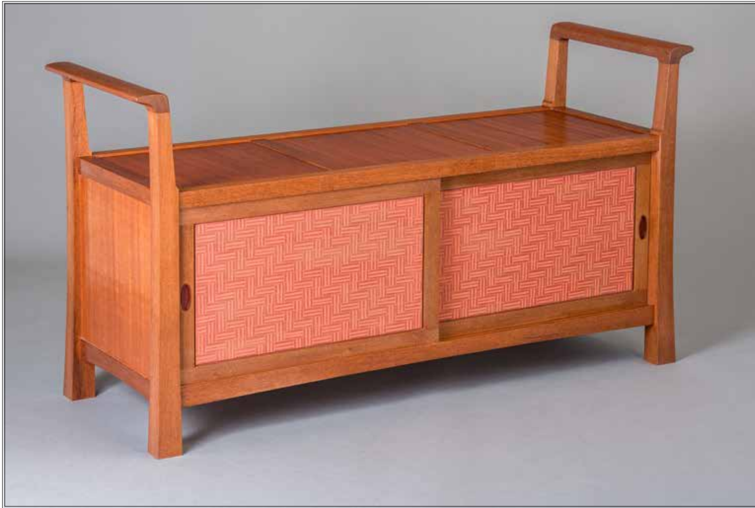
Shoe Storage Bench by Larry Stroud, AiW 2013