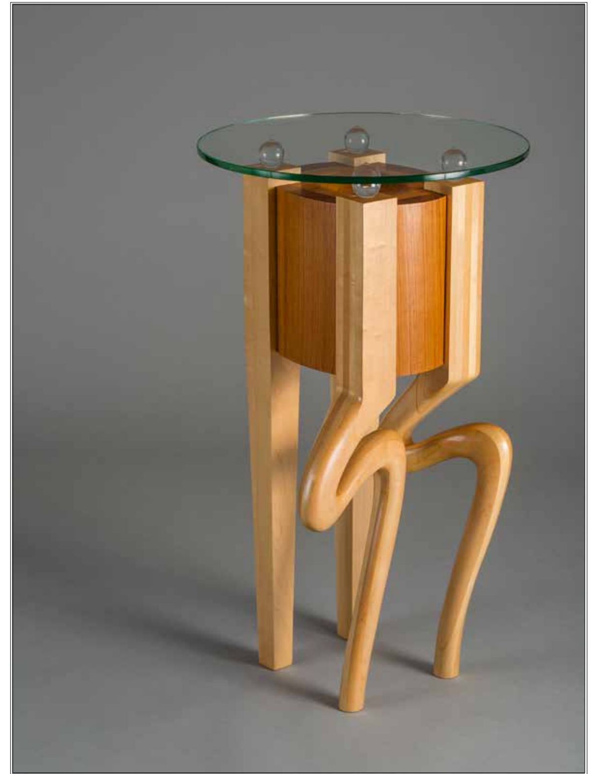
"What Lies Beneath" Table by Carol Salvin, AiW 2013