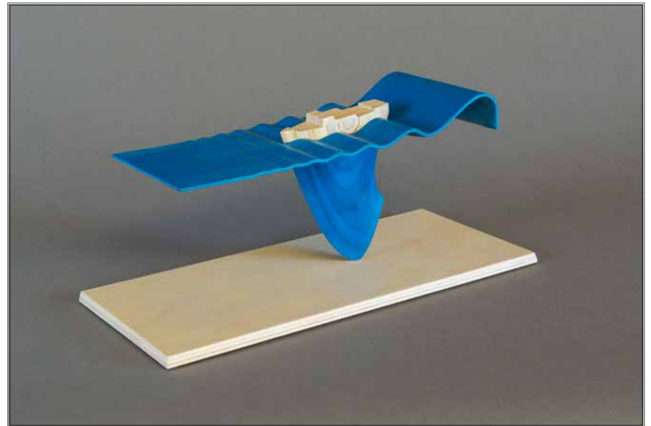
High Seas in the Bath Tub - Blue Wave by David Stohl, AiW 2017