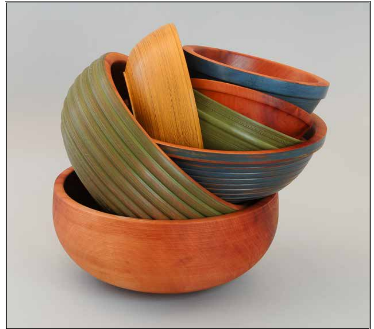
Stack of Bowls by Hugh Buttrum, AiW 2012