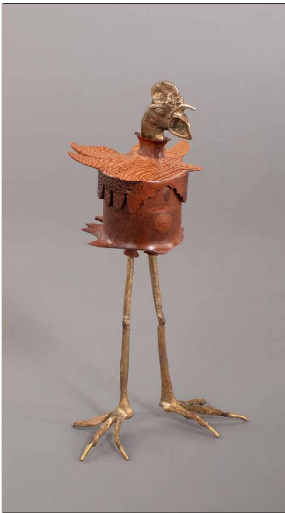
Award of Excellence: Wilt the Stilt - Petaluma Pecker Series