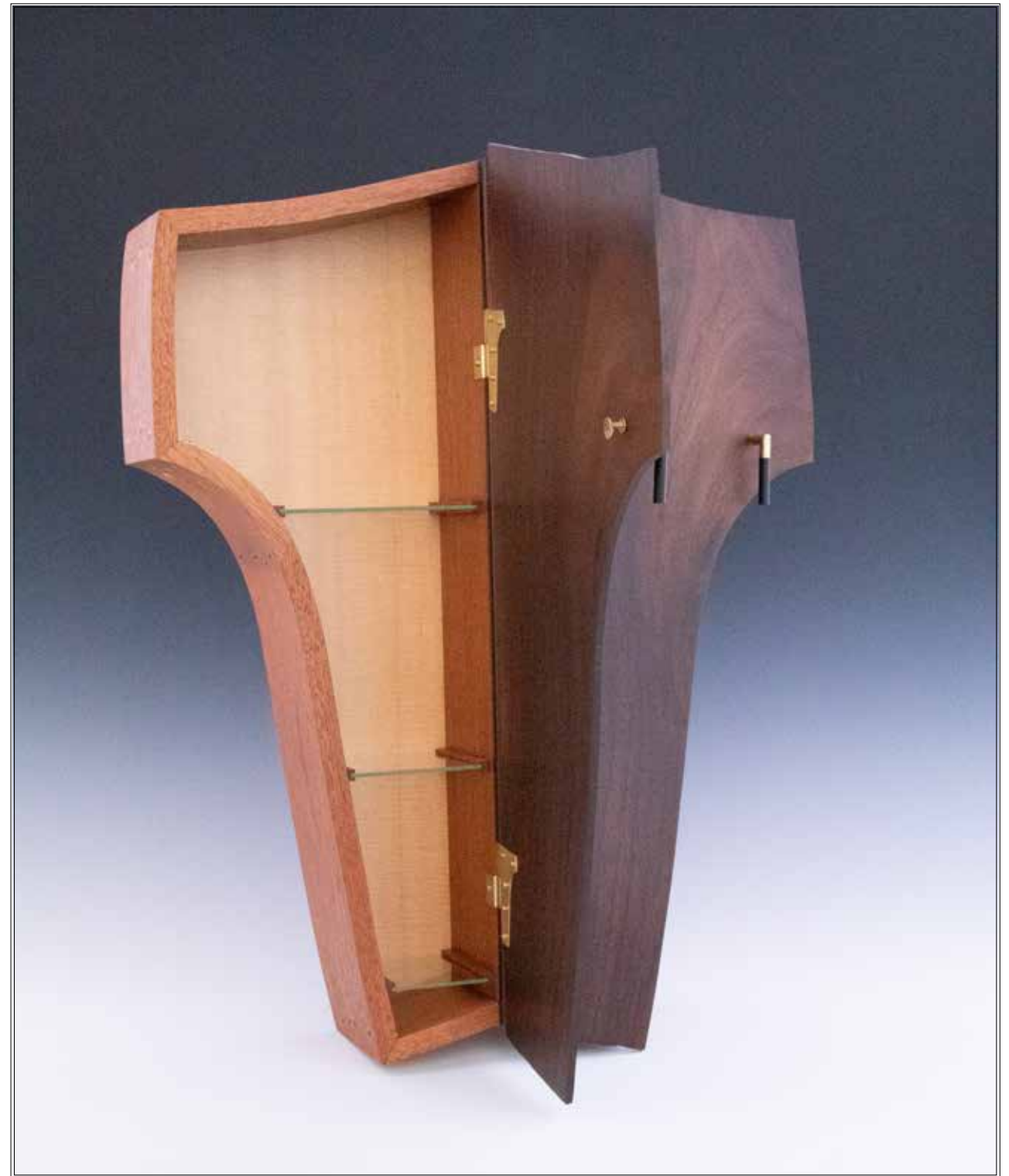
Best of Show: Wall Cabinet by Ralph Carlson