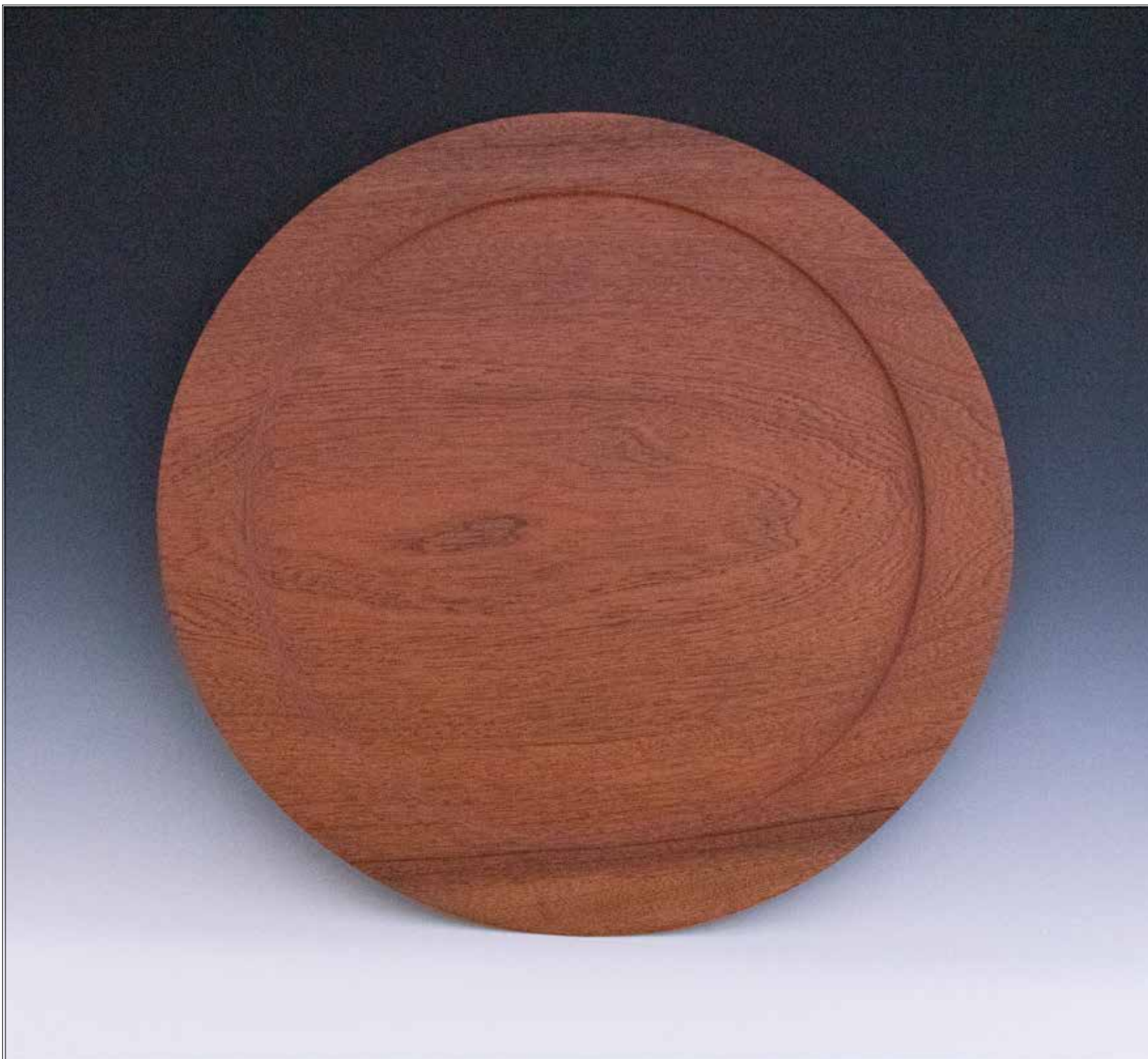
Award of Excellence: Sapele Platter by Warren Glass