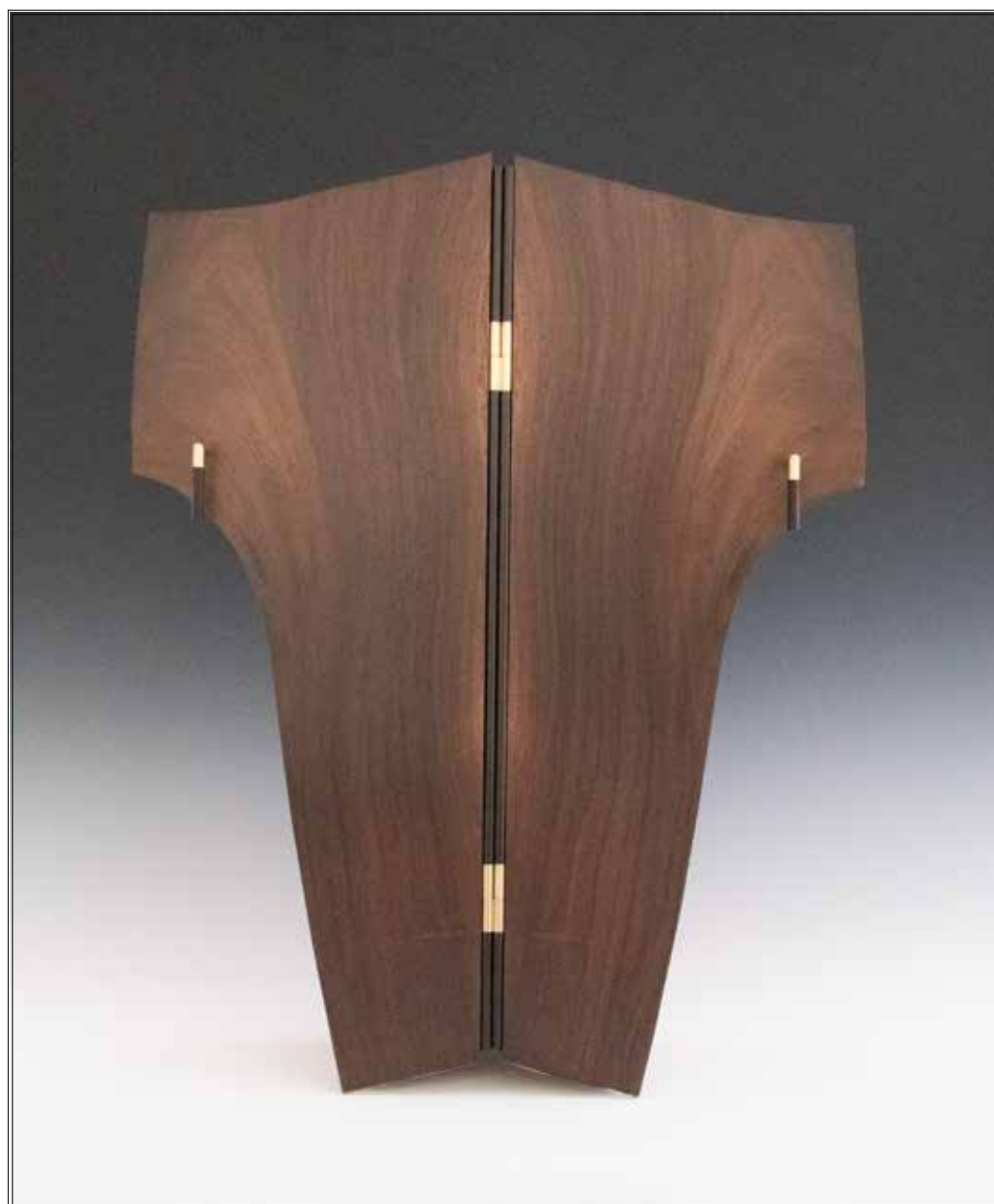
Best of Show: Wall Cabinet by Ralph Carlson