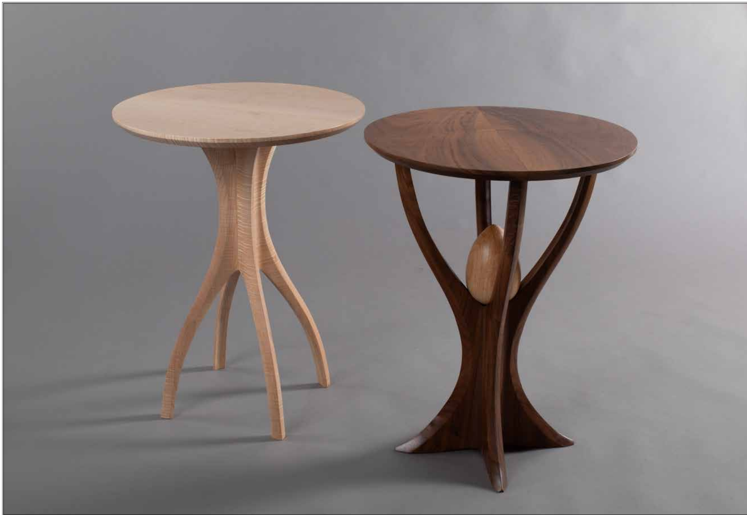
Award of Excellence: Yin and Yang Tables by Dugan Essick