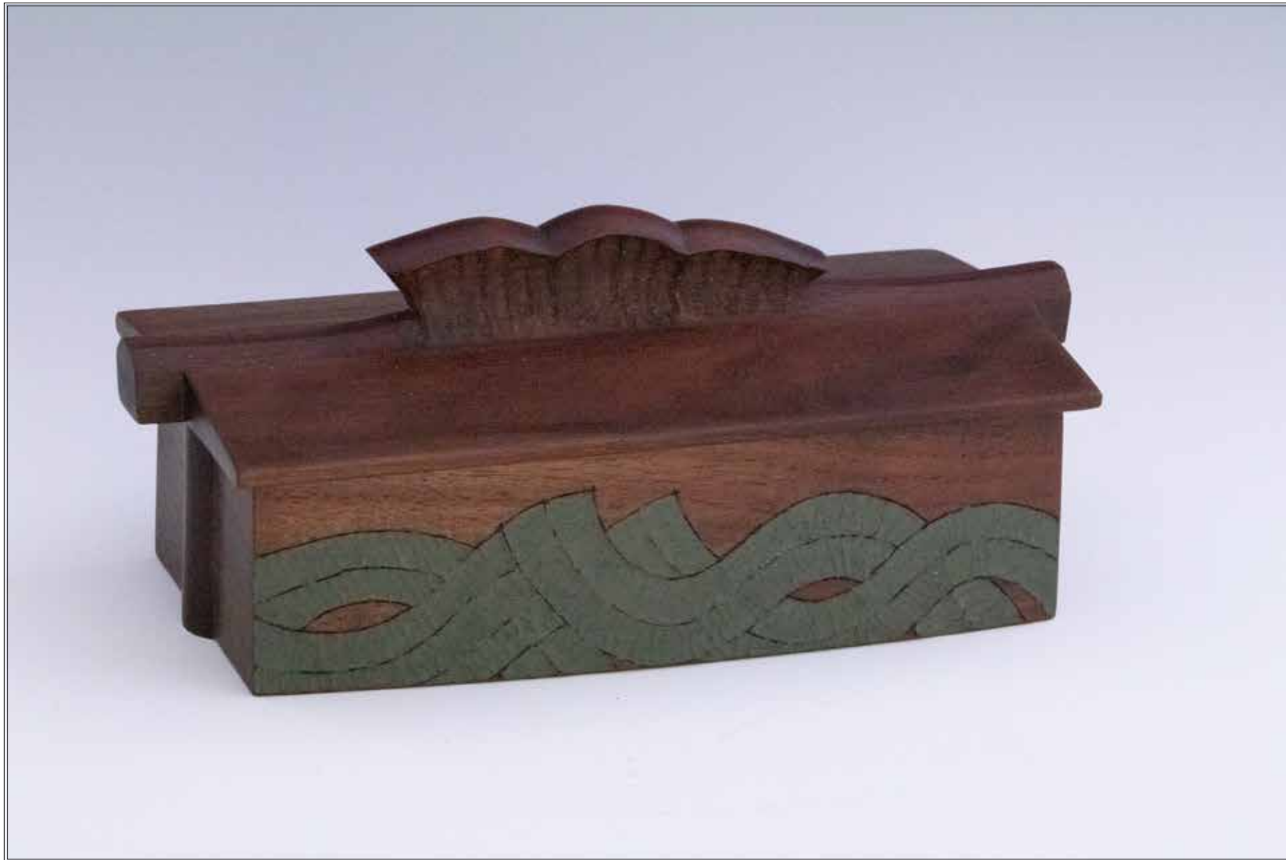
Best of Small Boxes: Black Walnut Bandsaw Box by Victor Larson